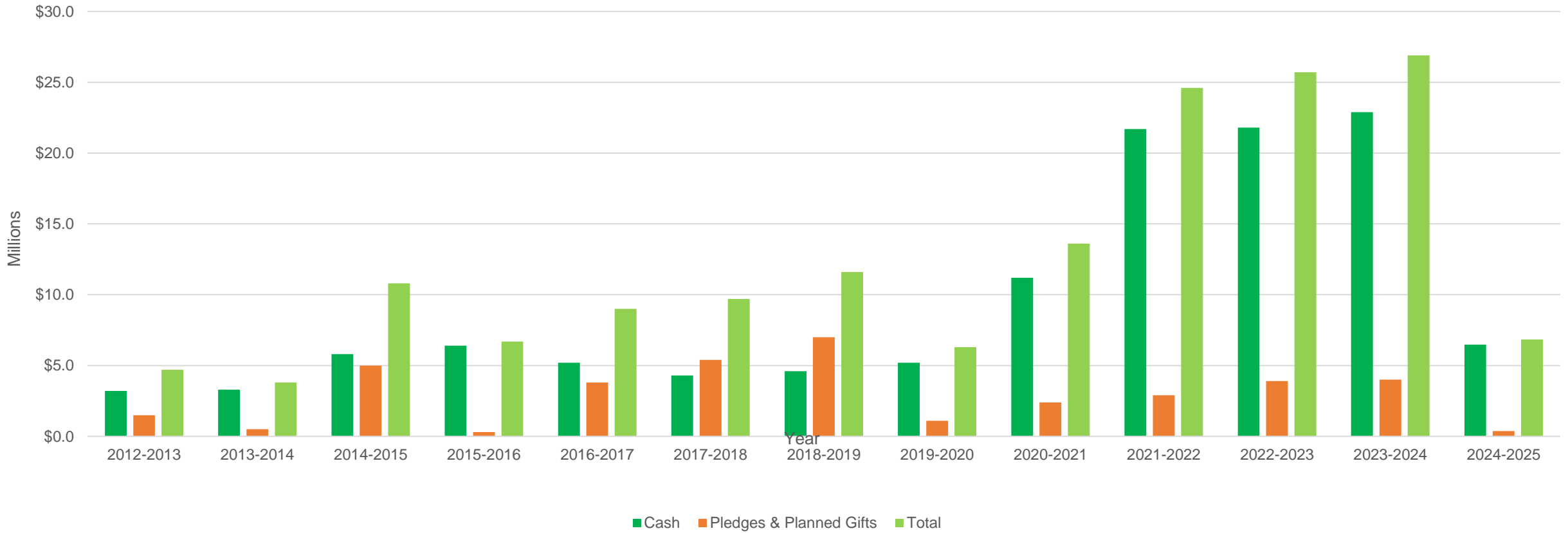
FAMU Fundraising Trend 2013-2025 as of 11/20/24